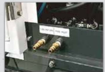
8 | External Fuel Tank Connections with 3-Way Selection Valve

*This is a digital rendering and does not reflect EXACT unit. Final look and features subject to change.