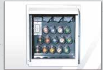
2 | Simultaneous Voltage Output Panel 120V - 20A x 2 | 240V - 50A x 3 | 240V & 208/480v Cam-Loks™