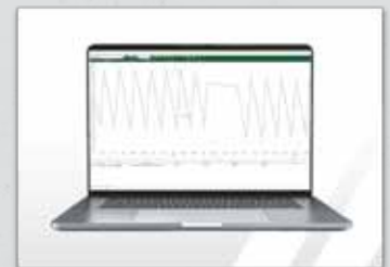
6 | Telematics Monitoring System Remote access and monitoring of runtime, GPS, load and more